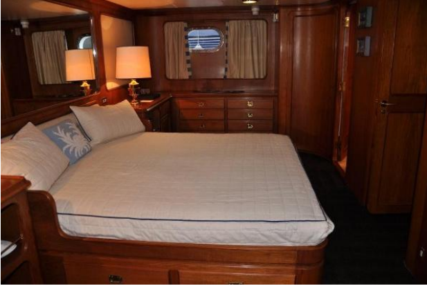
Vip lower deck