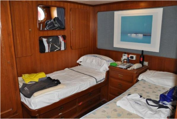
Guest lower deck