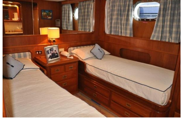
Guest lower deck