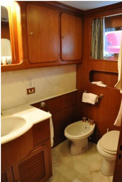
Guest lower deck