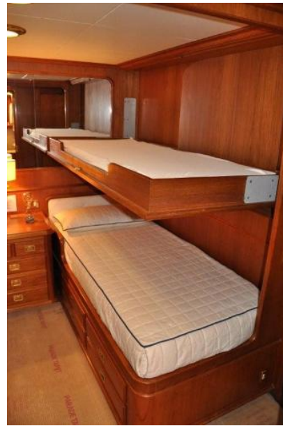
Guest lower deck